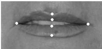
Figure 2: Picture of the lips at rest position taken with the video camera (60 fps), and the 6 points that served to determine on the vertical axis, the inner and external aperture, and on the horizontal axis, the stretching between the commissural of the lips.

Matlab program was built-up in order to allow for analysis. On every other frame, points were placed manually in 6 reference places (Fig 2) to measure the external and internal opening, and the stretching-rounding of the lips and euclidean distances were then calculated (in pixels) between these points. Each word was composed of about 70 to 100 frames.