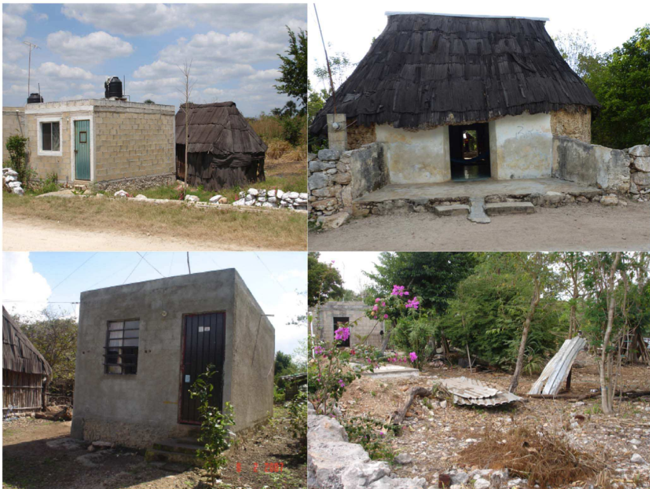
Figure 1. Typical housing and peridomestic structures in rural Yucatan, Mexico.

Houses were surrounded by a peridomestic area of on average 1300 \text{ m}^2 , limited by a fence of piled rocks (84% of houses). Vegetation was scarce close to the house and trees were somewhat denser further from it ( >10 \text{ m} ). Many families kept domestic animals all year round (58%), the most frequent being dogs (52%), chickens (49%), cats (34%), and songbirds (14%). Other animals such as rabbits, pigs, sheep, horses and cows were rather rare ( <3\% ). Animals were usually kept close to the house ( <10 \text{ m} , 83% of cases). Songbirds were kept in suspended cages attached to the fronts of houses, chickens and turkeys were sometimes kept in a corrals/coops (22%), while other animals had free range in the peridomicile. Construction materials were sometimes stored in the peridomicile (25%), while corn or other grains (13%) and firewood (10%) were stored inside the house. The peridomicile area was cleaned at least once a week in most cases (66%), usually by men. About 55% of families used domestic insecticide products such as mosquito coils (45%), plug-in repellents (32%) or spray insecticides (55%) on a regular basis, but only a few (5%) resorted to professional insecticide spraying. Thirty-nine percent of households reported having seen triatomines in their house.