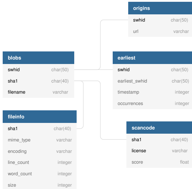
Figure 2: Relational data model for license blob metadata.

This variant of the GPL text is found with 604 different names, including "COPYING", "LICENSE.GPL3", and "a2ps.license". Note that both swhid and sha1 are used by other tables as foreign key targets and that there is no unique primary key in blobs , due to multiple filenames associated to each license file.