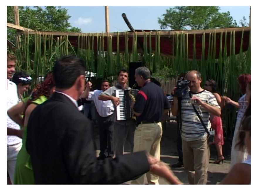
Fig. 2: The cameraman in the middle of the hora.

and ethnographic film. All commissioned home movies are thus marked by an overabundance of instructions to guide the cameraman's work. When I ventured to shoot the crowd, the children standing silently watching on the side-lines of the party – in order to have the wider context of the action being filmed –, my clients immediately pulled me aside and asked me to stop. They were motivated by the desire to spare the recording of these images from impoverishment and ethnic markers – the Gypsy Hood refers both in the eyes of my interlocutors and their gagi or români (non-Roma) neighbours to the representation of an ethnic and social enclave from which one must distinguish oneself at all costs .