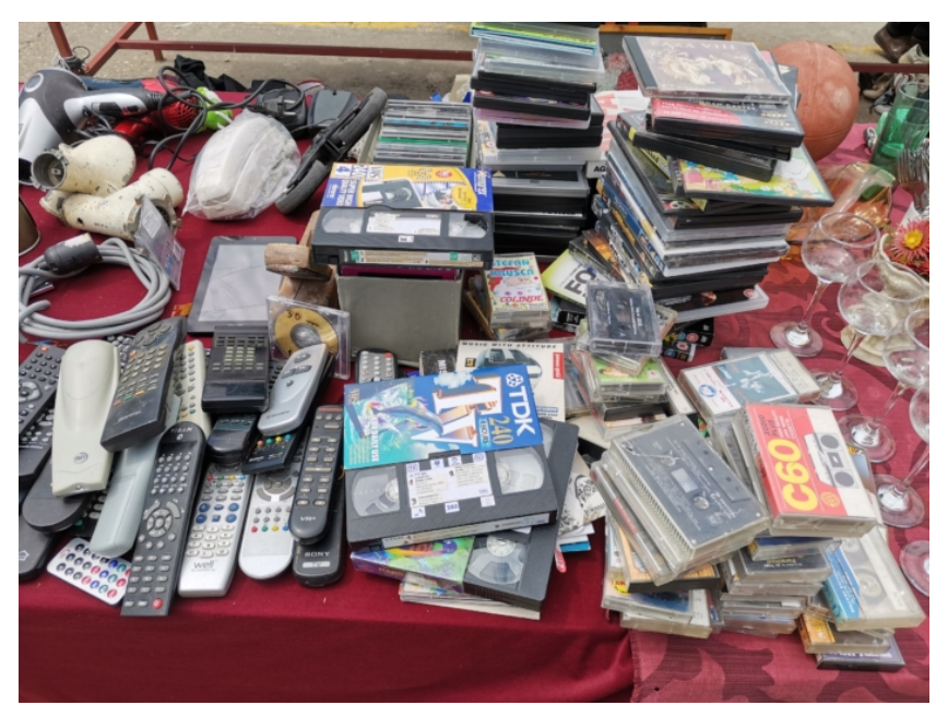
Fig. 4: Târgul Valea Cascadelor, a flea market where videotapes (mostly VHS) and DVDs are available for sale.

The sale and purchase of analogue videotapes (such as VHS, video8, or Hi8) and digital videotapes - MiniDVs - is a completely different matter. Unlike films, video recording media are sold for reuse. The price, fixed by each seller, is indexed to the quality of the technical components of the tape. The first criterion, following a utilitarian logic, is of course the resolution of the format, i.e. the amount of information that can be recorded on the tape – VHS tapes have only 240 lines of horizontal resolution, while video8 and Hi8 tapes contain 280 and 440 lines respectively, so they are more expensive. Next comes the length (in minutes) of the tape, and finally the rarity and reliability of the brand and model. This price scale is set by all sellers with the prospect that the tapes will be reused or, more rarely, displayed as decorative knick-knacks in shops, never to be actually put to use. None of my contacts had met customers interested in magnetic tapes for what they contain. During our telephone conversation, [25] Sorin, a collector and dealer of various rock sub-culture artifacts and hi-fi equipment, explained to me that TDK brand audio (and sometimes video) tapes, including MA, MA-X, MA-XG (MA for Metal Alloy) tapes, are known for their robustness and precision by collectors who wish to have a model missing from their collection. It does not matter if the tapes are blank or already used. The images recorded are never mentioned