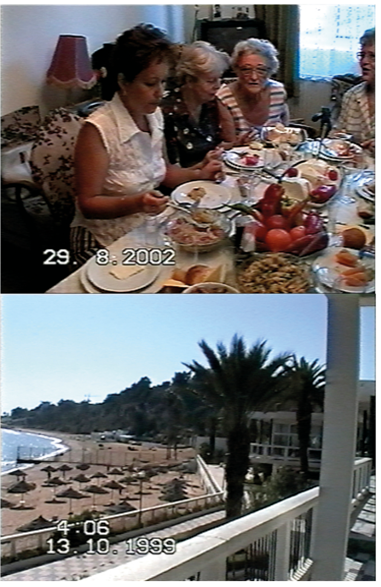
Fig. 8: Stills of a VHS-C video, showing different layers of recordings, in Romania in 2002 and Morocco in 1999.

the ordinary material culture of Romania over the past thirty years. The durability of these circulations for the productions of pirate videos or home movies, or for their resumption and resale on digital platforms, shows how much these different practices belong to the same media infrastructure.