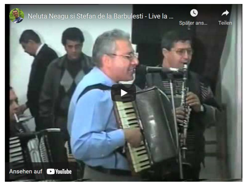
Fig. 3: Live at a wedding from Diţeşti, 1997.

This bifurcation of images, put into circulation according to a principle distinct from their initial use by collectors and YouTube users, can also be observed on other digital platforms. The tapes are not digitised; this time they are put on sale on e-commerce platforms, notably Olx and Okazii, the most used in Romania. Diverse documentary and educational films, or even home movies shot on celluloid (Super 8, 8mm, 16mm), are for sale on these platforms. Even if the precise content of the film is not described by the seller (some of them do not have a film projector), the monetary value of the film is always indexed to the rarity of the presumed content filmed or photographed, in addition to the metric length of the film. Thus, Robert,[22] one of my contacts, a film enthusiast and collector, is able to precisely describe the entire film collection that he has built up over the years by frequenting flea markets (piețe de vechituri) in Bucharest (such as Târgul Valea Cascadelor[23] [Figure 4]). It was notably through these channels that he bought a large stock of 16mm copies of educational films produced by Alexandru Sahia Studios under the communist regime in Romania, films that were sold at a discount in the 1990s as the factories where they were shown and stored closed.[24]