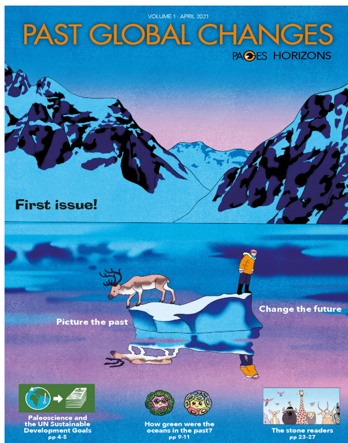
Figure 4: The first issue of PAGES' new magazine for anyone interested in paleoscience, Past Global Changes Horizons , was published in April 2021. 19

19 http://pastglobalchanges.org/products/pages-horizons