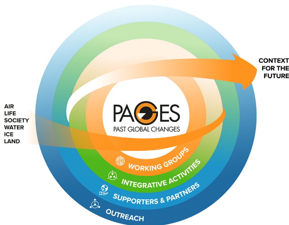
Figure 3: PAGES' proposed new science diagram (2021-). Concentric circles represent the building blocks of PAGES, which at its core is composed of working groups and integrative activities within PAGES' scope. Their research supports partner programs, informs strategies for sustainability, and provides outreach opportunities. The arrow represents the integration of information and learning that propels the paleosciences forwards and provides context for future projections.

PAGES will continue to be community-driven, with the support of its lean, efficient, and productive International Project Office. This includes even more global collection, dissemination, and synthesis across spatial and temporal scales, for phenomenologically meaningful regions and dimensions (e.g. patterns within and across elements in Fig. 3) by means of Open Science Meetings 2 and clustered meetings, in which multiple working groups convene to consider shared interests and opportunities, such as the Topical Science Meetings. 3 Although we acknowledge that personal contacts are at the heart of international science, we anticipate that meetings will become more and more internet-enabled, and virtual, to reduce their carbon footprint. This will enhance the goals of building a community, but also improve accessibility, which is especially important for an increasingly global PAGES.