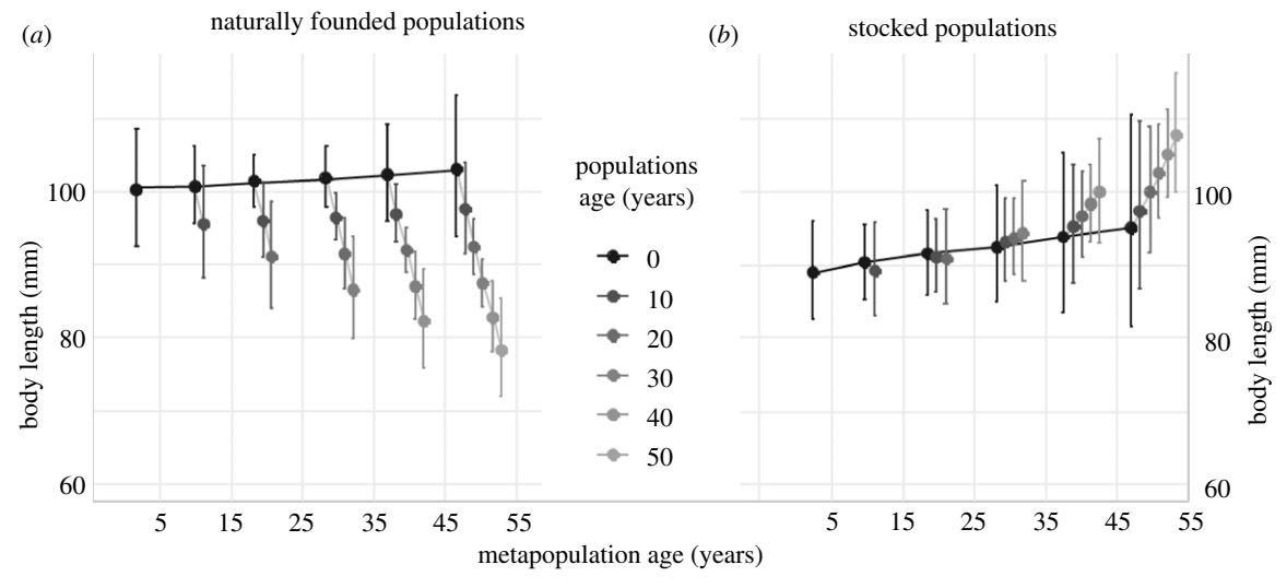
Figure 2. Average body size in millimetres (dots) with 2.5–97.5% CI (vertical segments) predicted (using fixed effects) at the mean capture date (226th day of the second year) by the best model, as a function of metapopulation age and population ages for (a) naturally founded populations and (b) stocked populations. The black lines between dots indicate changes of body size in newly founded populations along the expanding range, the grey lines indicate changes of body size when populations get older.

colonized patches with the core of the metapopulation will facilitate gene flow between populations founded at very different dates, also presenting contrasted densities [44]. Although spatial sorting occurs when body size at age is heritable, we cannot in the present analytical framework assess the relative contributions of pure genetic factors versus parental and epigenetic effects.