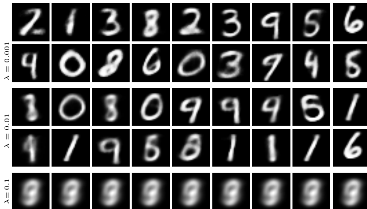
Figure 2: Random samples from generative models learned on the MNIST dataset with Alg. 1, for 3 regularization parameters \lambda .