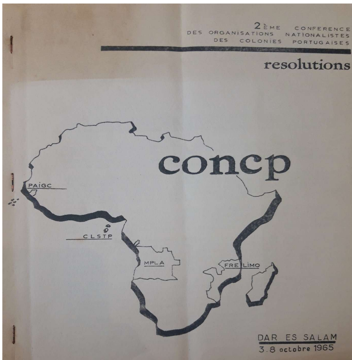
Fig. 2 - ADSS, 19, 2eme Conférence des organisations nationalistes des colonies portugaises

In a 1970 letter to Maurice Gastaud, a French supporter of his cause, Cabral argued that their struggle was 'Mainly against ignorance and other social evils which are the fruit of colonialism'. 24 This implied seeking UNESCO support to print a few dozen thousand copies of a list of textbooks for primary teaching, which included two geography books. According