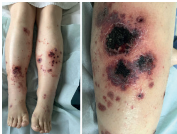
Fig. 1. Lower-limb purpura 3 months after onset of symptoms.

A 54-year-old woman who had axial and peripheral PsA for 6 years was referred to our dermatology unit for cutaneous purpura progressing for 3 months, recently associated with febrile diarrhoea. Previous treatments for PsA included methotrexate alone, then methotrexate plus adalimumab. After one year of treatment with adalimumab and methotrexate, she had developed paradoxical pustular palmoplantar psoriasis, which was controlled by topical steroids. Two years later, her PsA was no longer controlled and adalimumab was switched to secukinumab, in association with methotrexate, with rapid control of PsA. One month after starting secukinumab, the patient developed psoriasiform lesions on the vulva, with nodular and pustular purpura on the lower limbs. Secukinumab was stopped 2 months after onset. One month later, the patient presented sub-acute febrile diarrhoea with persisting necrotic purpura on the lower limbs (Fig. 1). Biological analyses showed normal platelet count, renal and liver function, elevated C-reactive protein level, and negative serology for HIV or hepa-