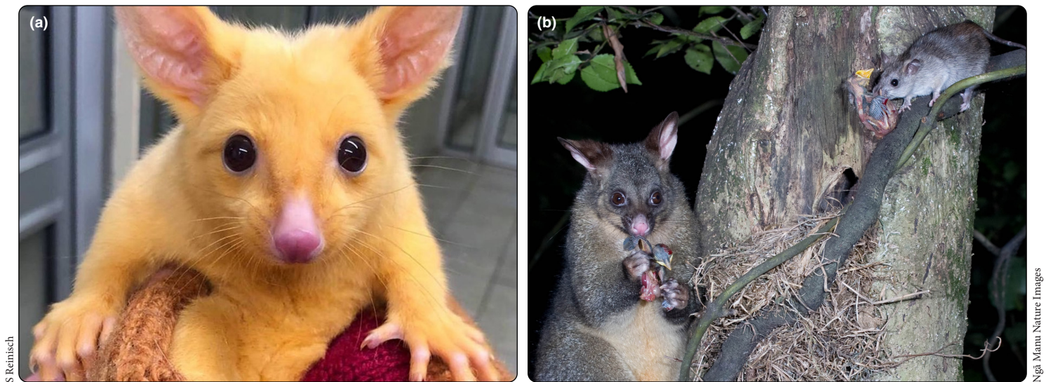
Figure 3. The way in which an IAS is presented in the media can strongly affect public perception. An example includes the common brushtail possum ( Trichosurus vulpecula ), which has been depicted both (a) positively as a “Pikachu”-like animal and (b) negatively, here with a black rat ( Rattus rattus ) as nest predators of the song thrush ( Turdus philomelos ). All three species are IAS in New Zealand.