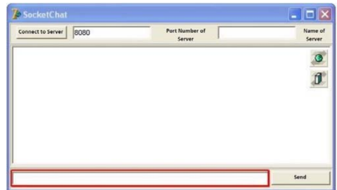
Fig. 6 Text sending by the user

TcpClient.Sendln (Encode (edSendText.Text);)