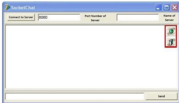
Fig. 2 The main dialogue box of the developed software

TObject;ClientSocket: TCustomIpClient;) Begin