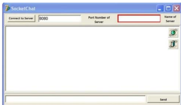
Fig. 4 The name of the server