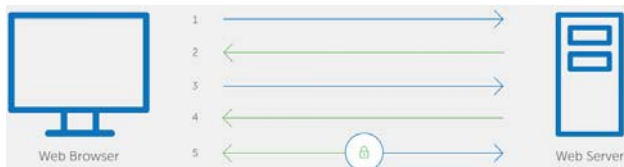
Fig. 1 The connection between the web browser and webserver using the SSL system [9]

security features to secure insecure application layer protocols such as HTTP and HTTPS. Based on that, cryptographic algorithms are applied to plain text that is supposed to pass through an insecure communication channel such as the Internet, and ensures that data are kept confidential throughout the transmission channel. An SSL certificate is required for a website to have a secure SSL connection. The connection between the web browser and webserver using the SSL system is shown in Fig. 1 [9].