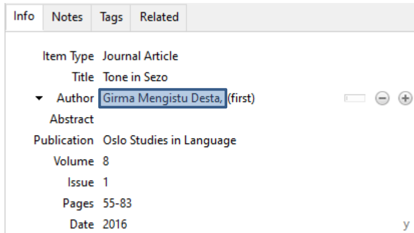
Figure 1. Zotero metadata sheet

In order to sort Ethiopian authors by their GIVEN NAME according to R2, all name components (GIVEN NAME, FATHER’S and GRANDFATHER’S NAME) need to be inserted into the field “last name”; the field “first name” remains empty (Figure 1). 5