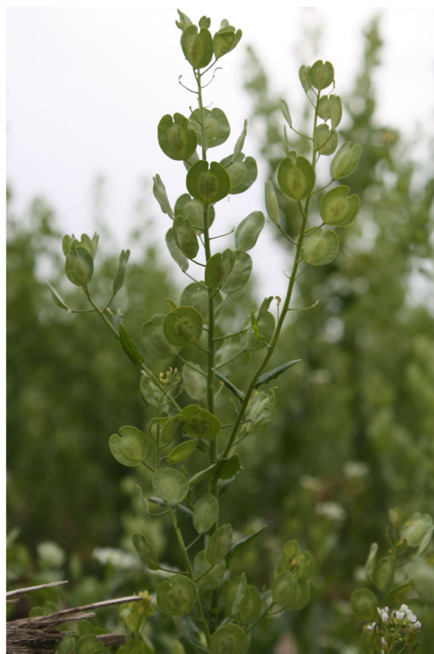
Fig. 2 Pennycress line used to assess agronomic properties in field production. Prior to ripening, silicles and seeds have reached their full size but have not begun to mature.

better germination and a longer vegetative growth period prior to winter frost (Phippen et al. 2010b; Royo-Esnal et al. 2017). In comparison to late fall planting dates, early September planting dates also resulted in higher yields and earlier harvest dates (Dose et al. 2017), which is favorable for double-