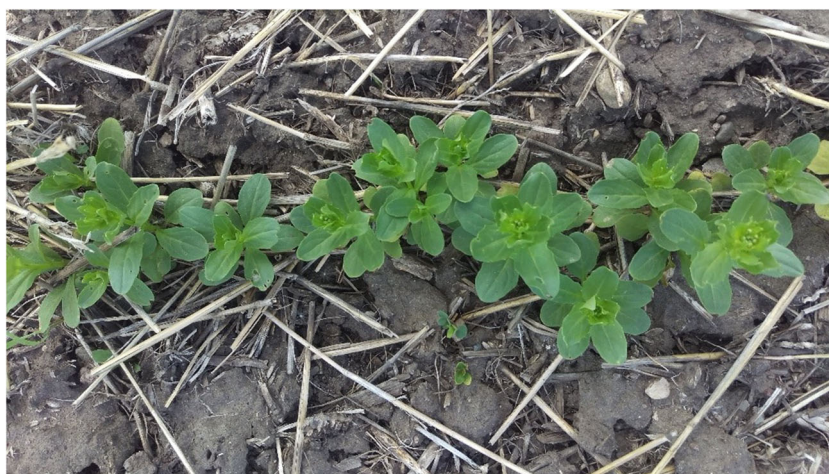
Fig. 1 Pennycress overwinters as a rosette providing late fall and early spring ground cover when summer annuals are not on the landscape. Ecological benefits of winter cover include suppression of early spring weeds and a reduction in nutrient runoff due to early spring precipitation and snowmelt.

and winter survivability (Saarinen et al. 2011). Interest in pennycress as an agricultural crop (Figs. 1 and 2) has been spurred by the demand for alternative land use to mitigate prominent, but unsustainable, farming practices in the Upper Midwestern USA (Heaton et al. 2013; Sindelar et al. 2017). Unlike many winter annual crops grown in the Upper Midwest, pennycress seed can be pressed for oil and provide near-term economic benefits to growers (Moser et al. 2009a, b; Moser 2012). While research has been conducted on pennycress as a persistent weed in canola ( Brassica napus ) and wheat ( Triticum aestivum ) for decades (Best and McIntyre 1975; Warwick et al. 2002), earnest development of agronomic management practices for pennycress as a cultivated crop did not begin until its oil was evaluated as a potential biodiesel feedstock in 2009 (Moser et al. 2009a, b) followed by the sequencing of the genome in 2015 (Dorn et al. 2015). More research is necessary to determine the agronomic best management practices given the recent emergence of pennycress as a crop. The objective of this review was to compile and summarize current agronomic research on pennycress and identify gaps in knowledge for future research.