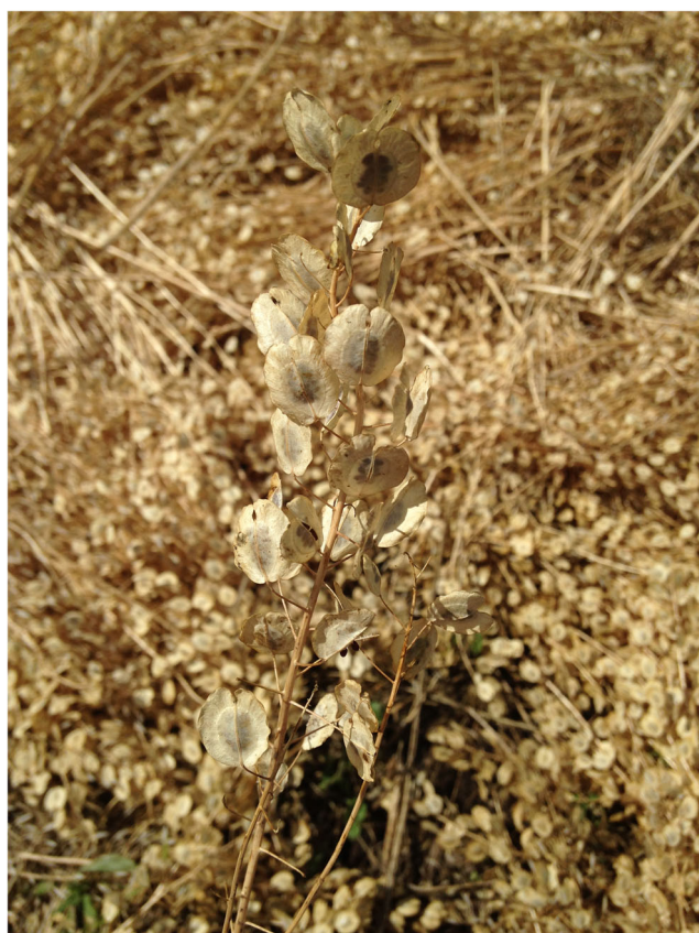
Fig. 3 Pennycress at harvest maturity when plant and seed moisture have reached adequate levels (12–15%) for effective mechanical harvest.

occurred nearly 2 weeks prior to typical harvest periods, i.e., harvest maturity (Fig. 3), when seed moisture was low enough for effective mechanical harvest (Cubins 2019). Delaying harvest until typical harvest periods resulted in a 70% loss in seed yield compared with harvesting at physiological maturity, i.e., maximum yield potential. Consequently, Cubins (2019) proposed the use of a harvest aid at physiological maturity to dry pennycress to a point that facilitates efficient mechanical harvest. The majority of agronomic studies reviewed were harvested by hand (Table 1), which does not require seeds to have reached full maturity by the time of harvest. In some studies, however, paraquat dichloride (1'dimethyl-4,4'-bipyridinium dichloride) was applied to assist plant drying prior to combining (Eberle et al. 2015; Dose et al. 2017) and may be used as a desiccant in the future to decrease the time between physiological maturity and harvest maturity. Harvest timing spanned mid-May through mid-July at all reviewed study locations. Studies that were conducted in Illinois were more likely to be harvested in late May or early June (Phippen et al. 2010b; Rukavina et al. 2011; Phippen and Phippen 2012) as opposed to studies in western Minnesota and North Dakota, which were harvested between late June and early July (Carr 1993; Eberle et al. 2015; Gesch et al. 2016; Dose et al. 2017; Cubins 2019). Different growing conditions (e.g., length of winter