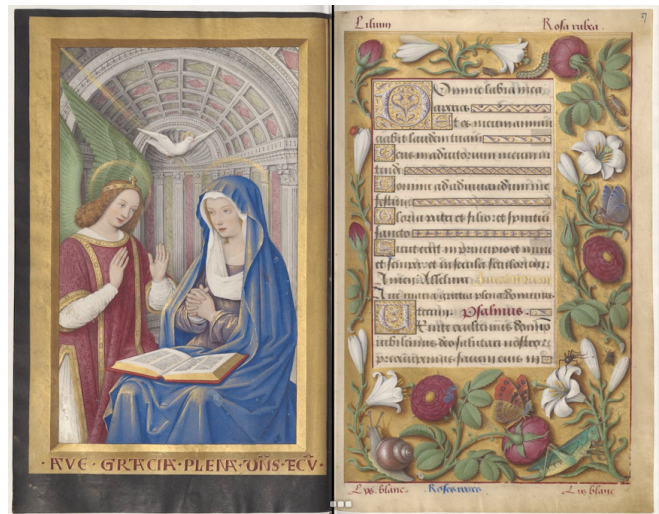
Figure 2: Two pages from the so-called "Grandes Heures d'Anne de Bretagne", a book of hours in Latin, Paris, Bibliothèque nationale de France, Latin 9474.

Figure 1 presents examples of text recognition on three separate books of hours with two different writing styles. The manual transcription which represents the gold standard is labelled as 'ref', while the result of the automatic transcription is labelled as 'hyp'. We notice several recognition errors: on the left side, the abbreviated 'et' at the beginning of the line is not recognized, while the abbreviated 'per' is mistakenly expanded as 'par'. In the second line, ij and u/v are incorrectly disambiguated; the first line of the middle book (Metz 1581) is truncated; on the right side (Harvard Rich 9), if the abbreviation 'et' is recognized, there is a confusion between the letters c and t . Overall, the word error rate (WER) is of about 30%.