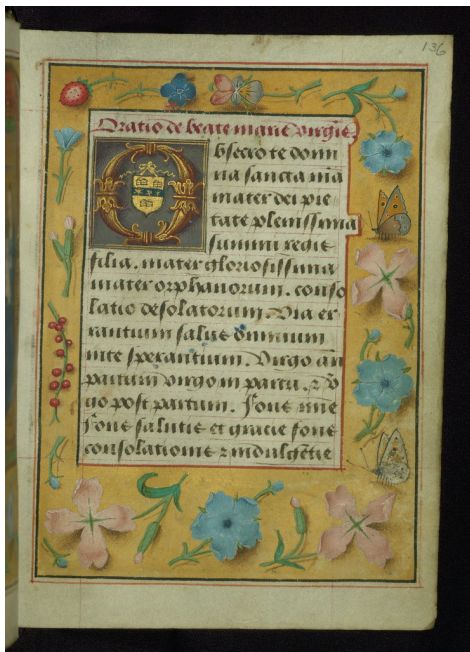
Figure 3: Example of a book of hours folio of Obsecro Te prayer that begins with ornaments.

Obsecro Te 14 (I beseech You...) and O Intemerata (O chaste...) are two prayers that may appear early in the book of hours (e.g. right after the Gospel readings) or within the prayers section at the end of the book. The prayers are named after their first words ( incipit ): Obsecro Te domina sancta Maria... , and O Intemerata, et in aeternum... , etc. Often, the beginnings of these prayers are illustrated with ornaments around the first letter of the prayer as illustrated in Figure 3 15 . This may lead to errors in transcriptions.