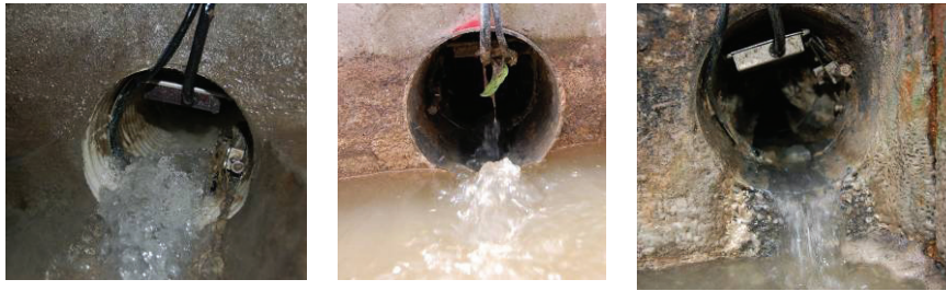
Figure 1 – Problematic flow gauge installation (Trofa)

Regarding flows monitoring, the main problems result from the predominance of small sewer diameters, low flows, high flow velocities, irregularities in the construction of sewers and manholes, type of equipment used, accumulation of solids in the sensors and deficient gauge installation. Illustration of some problems is given in Figure 1.