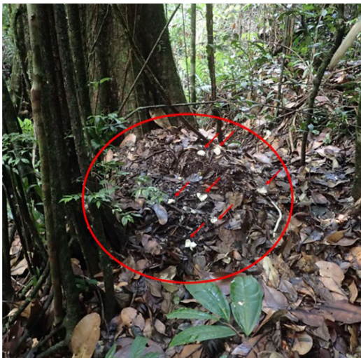
Figure 1. Nest of Paleosuchus trigonatus in the Nouragues natural reserve, French Guiana (4.0667°N, 52.6833°W; Datum WGS84; 20 m elevation). Position indicated by the red circle. Arrows indicate remains of the eggshells.

On the 16 th of November 2017, five meters from the bank where the neonates had been discovered, the remnant eggshells of a recent nest were found. We believe that nest to be the neonates' origin. It was made out of dead vegetation and measured about 140 cm of diameter and nearly 60 cm of height (measured with a tape to the nearest centimetre) and was located adjacent to a big tree (Figure 1). One eggshell was found nearly intact measuring 67.1 mm of length and 41.2 mm of diameter (measured with a calliper to the nearest 0.1 millimetre).