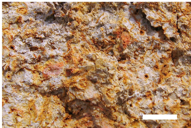
Figure 3. Close-up photograph of the typical soil structure in the subsoil horizons of the Ban Nabone site showing oxidized micro-domains (mostly along cracks and around root channels) in brown-red colours immediately adjacent to reduced micro-domains where greyish colours prevail. The white horizontal bar to the bottom right of the photograph represents 5 mm.

likely to have occurred in the liquid enrichment media, and may have accounted for the fact that enrichment cultures were frequently negative even when direct plating on solid media yielded B. pseudomallei . Remarkably, all quadrat/depth combinations but one yielded a negative culture at least once, suggesting that there were probably a number of false negative results. The enumeration of B. pseudomallei in soil samples using culture methods is also fraught with difficulty, and whilst we attempted this, as has been done in previous studies, we consider that the results should be treated with extreme caution.