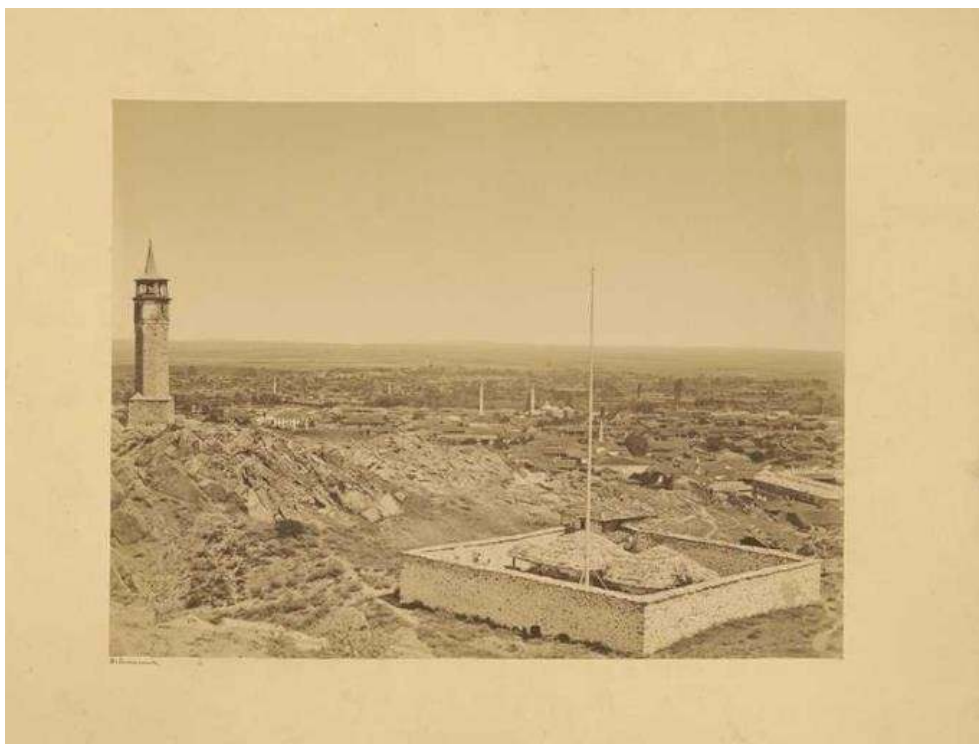
Figure 3. Dimitri Ermakov. Plovdiv, Sahat Tepe, 1876