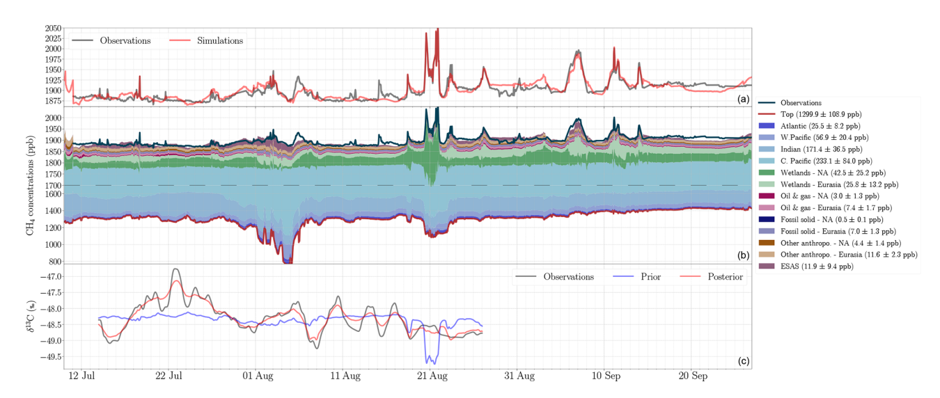
Figure 2. (a) Observed and simulated total CH<sub>4</sub> concentrations. (b) Simulated contributions to total CH<sub>4</sub> concentrations. Individual regions simulated by the model (see Fig. 1) are aggregated into two main continental components: North America (NA) and Eurasia. Light green areas depict Eurasian (mostly Siberian) wetlands, while dark green ones are North American wetlands. Shaded blue areas represent contributions from the sides of the CHIMERE simulation domain (see Fig. 1). Orange shades represent minor anthropogenic contribution. So-called "top" line gives the simulated concentrations originating from the lower stratosphere (i.e. from the top of CHIMERE simulation domain). Please note the gap in y axis scale at 1700 ppb, highlighted by the dashed line. (c) Observed and simulated isotopic ratios before (prior) and after (posterior) inversion.

inant large-scale transport patterns, contributions from the stratosphere and from the model lateral sides (located in the Tropics) can vary by more than 400 ppb within a few days. This corresponds to dominantly updraught or downdraught transport patterns, as illustrated by Fig. S2 in the Supplement. These very strong variations in total CH<sub>4</sub> enhance the impact of uncertainties in the vertical and horizontal distribution of isotopic ratios at the hemispheric scale. First, tropical air masses are influenced by tropical wetlands and anthropogenic emissions, causing a spatial and temporal variability in tropical isotopic ratio of up to 1 ‰, which is not accounted for in our CHIMERE set-up with fixed isotopic ratios at the simulation domain sides (see Sect. 2.2). Second, the vertical profiles of isotopic ratios in the Arctic (see simulated example from the global transport model LMDz in Fig. S3 in the