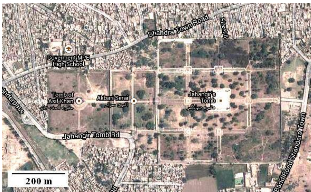
Figure 1 - The Jahangir's Tomb is located near the town of Shahdara Bagh in Lahore, Pakistan. The mausoleum is at the centre of a walled garden, the Dilkusha Charbagh.