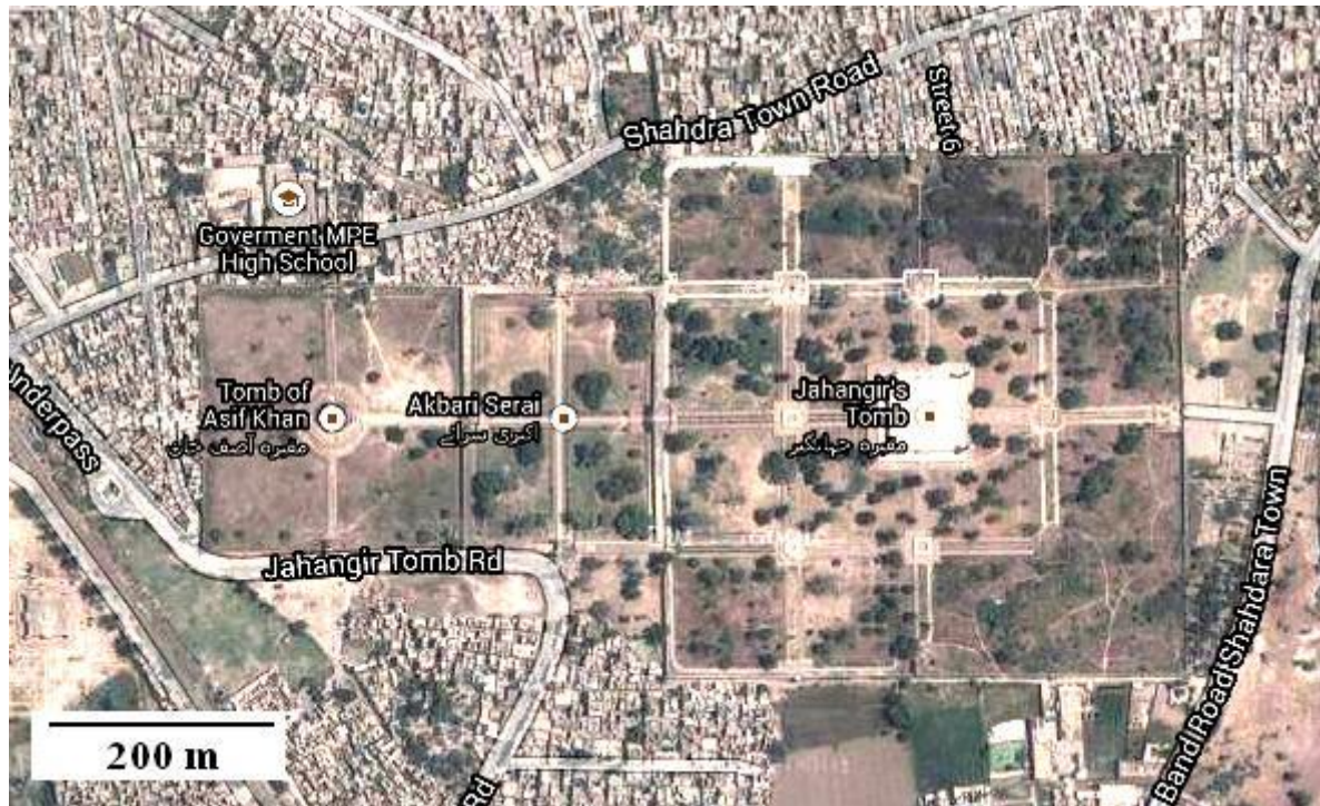
Figure 1 - The Jahangir's Tomb is located near the town of Shahdara Bagh in Lahore, Pakistan. The mausoleum is at the centre of a walled garden, the Dilkusha Charbagh.