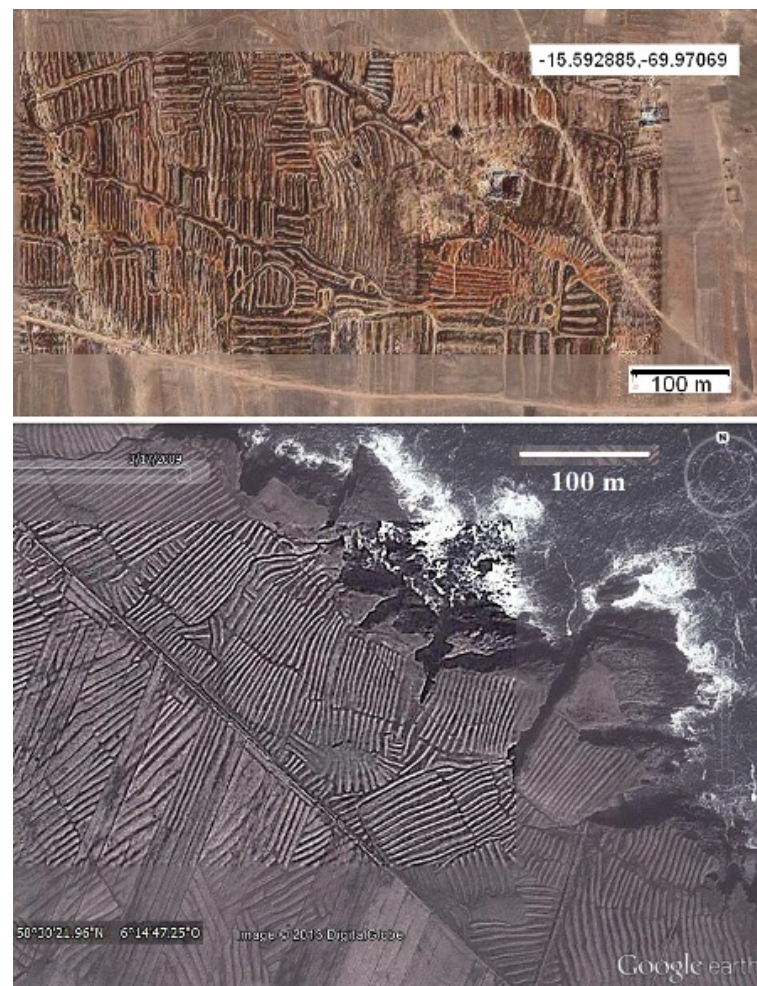
Figure 1: In the upper panel we can see waru-waru fields near Puno, Peru, close to Lake Titicaca. In the lower panel, we have the runrig fields of the Isle of Lewis, the largest island of Hebrides, Scotland. The images from Google Earth have the central part enhanced with image processing.

In [7], an interesting anthropological paper is discussing the organization of ancient intensive farming, comparing "top-down" and "bottom-up" perspectives. The "top-down" approach is that considering the development of intensive farming with social organization attributed to the rule action of a centralized government. On the other hand, the "bottom-up" approach is viewing intensive farming as the incremental work of local communities. For the raised fields of Titicaca, both "top-down" and "bottom-up" interpretations have been proposed [2,8,9]. In the case of runrig, this was clearly a "bottom-up" system.