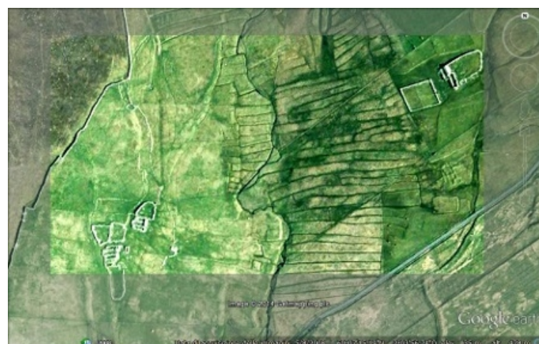
Figure 4: Runrig of Foula, Shetland Islands.