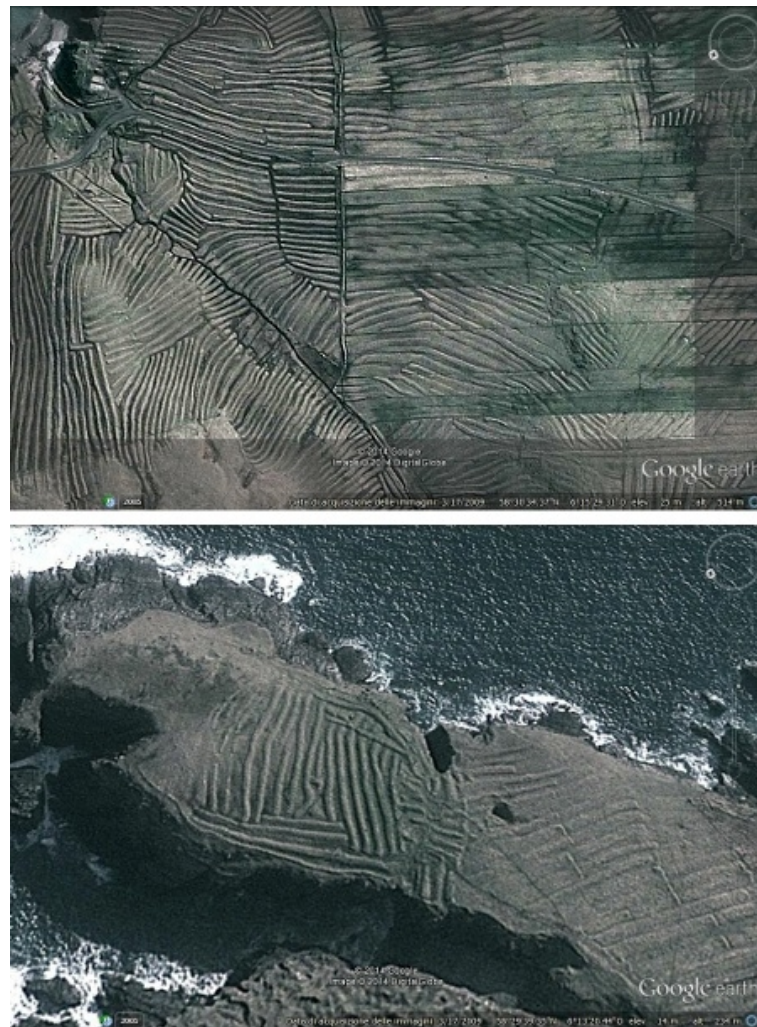
Figure 2: Other examples of runrig. In the upper panel we can see this ancient system visible under the modern agricultural activity. In the lower panel, we have runrig over a promontory near Port of Ness, Isle of Lewis. In this case, it seems that a sort of artistic intent had been added in creating these earthworks.