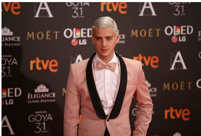
Fig. 6: The young Spanish film-maker Eduardo Casanova at Premios Goya, 2017.

Furthermore, if the media are not slow to take an interest in the appearance of Drake with a pink jacket, Justin Bieber with a pink hoodie, or Kanye West who often appears in pink, the extension of millennial pink to the male wardrobe is seen by some media as a feminization of men's fashion, a movement from feminine to masculine often at work when it comes to unisex fashion. It must also be added that we must not confuse sex and sexual wear of clothing, and there are always women's and men's cuts, in addition to unisex cuts (Guionnet and Neveu, 2009, p. 46): if men wear more and more pink, it colors either costumes (fig. 6) or streetwear.