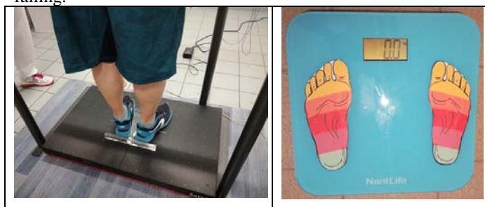
Figure 2. Left: highly standardized position of force-plate Right: standardization at home with BQT

Contrary to the initial design and protocol of the BQT, the force-plate strongly constrains the body position: the feet are positioned by the wedges inserted in the force-plate (picture left), and the patient is asked to look at the red line projected by the video projector in front at eye level. The position of the feet - glued knees, "duck" feet - is not very pleasant. However, looking at a fixed point in front indeed helps to remain more stable. The absence of any markings on the BQT emerged from the collaborative sessions with the 3 professionals as being a failing.