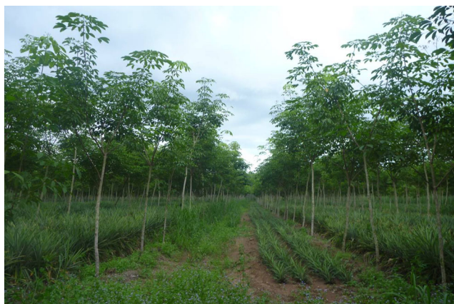
Fig. 1 A 2-year-old rubber plantation intercropped with pineapple in Chachoengsao Province, Thailand

Many results were returned by Google Scholar for each section; we selected only the most relevant, namely those which clearly described experimental results and provided