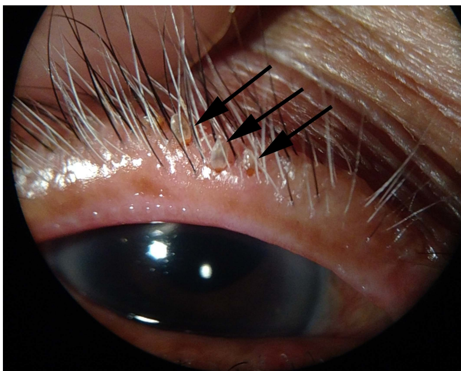
Figure 1 Arrows showing the larvae of Rhipicephalus (B.) microplus attached to the upper eyelid of the right eye.

An 82-year-old female with itchy, red, and watery eyes was admitted to the Sri Guru Ramdas Institute of Medical Sciences and Research, Amritsar, Punjab. Slit lamp examination revealed that a large number of ticks adhered to the upper and lower eyelid margins of both eyes (Fig. 1). All ticks were manually removed with blunt forceps and preserved in 70% alcohol. After removal of the ticks, attachment sites were cleaned thoroughly with antiseptic solution (povidone-iodine solution). Ciprofloxacin 0.3% ointment was prescribed to be applied to the affected area twice daily for a week. On examination, the patient revealed that she was engaged in dairy farming and had close contact with domestic livestock. To find out the source of infestation, we visited patient's home with our co-fellows and observed that her livestock were heavily infested with the tick R. (B.) microplus . Despite of being aware about the infestation of their livestock, the patient's family had taken no action to control the ticks. They were advised to treat the animals with acaricides to avoid further infestations.