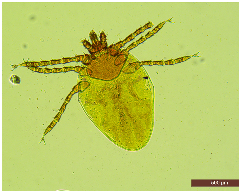
Figure 2 Larvae of R. (B.) microplus .