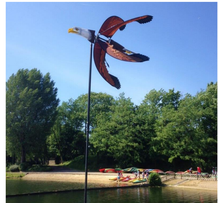
Figure 1: Scarecrow (Eagle) to scare off birds.

A part of this project was to test the hypothesis of bacteriological contamination by aquatic birds massively occupying the leisure center (fig.1) using a microbial source tracking technique. This approach relies on the quantification by real-time PCR (qPCR) in water, sand, and sediment of bacterial specific markers of the digestive tract of different animal species (geese, seagulls, dogs) and humans.