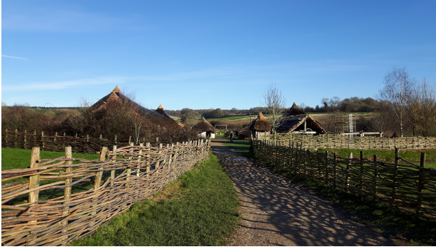
Figure 1: Buster Farm, Sussex (UK)

potential to immerse spectators in environments which have a spatio-temporal dimension.