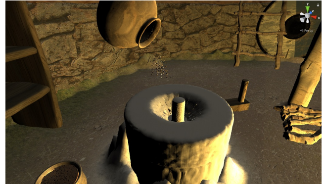
Figure 12: Falling seeds from the pot into the rotary quern

Very often, similar projects on cultural heritage are driven by archaeologists, curators or historians and implemented by private companies. In this case, all the digital 3D assets and code remain generally the property of the private company and further evolutions must be negotiated. The cost of a VR system in the context of a museum can arise. However, this must be compared with a physical reconstruction of sites. These sites are very difficult and costly to maintain because of the construction techniques used. In addition physical reconstructions are subject to security constraints such as the addition of emergency exits, security and accessibility equipments that undermine the authenticity of the reconstitution.