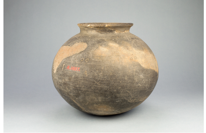
Figure 2: Late Iron Age funerary urn from Saltdean, Sussex (UK)

The urn is an important artefact of the collection of the museum, as it reveals important information about the life of local communities in the late Iron Age in the south east part of Britain before the arrival of the Romans. Even though there are no signs of a big agricultural settlement in the area (larger settlements have been found at the Hollingbury Hill Fort, Devil’s Dyke Hill Fort, Kempton, Newhaven and Coldean; all close to Brighton), the urn and its contents indicate that some small agricultural and farming communities might have lived in Saltdean in late Iron Age. Such community could have been built near the white chalk cliffs overlooking the sea.