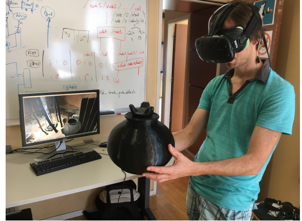
Figure 10: Testing the 3D printed urn with tracker interactions

walk in the dedicated physical space and can interact with different elements through the position of the pot. In each context, an area is dedicated to the access of the other contexts with the same metaphor of floating spheres.