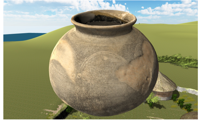
Figure 3: 3D model of the funerary urn with texture as shown in the VR environment

The model of the pot was then 3D printed in full-size (see Figure 10) on a Raise3D N2 Dual Plus owned by the computer science research institute. This 3D printer is able to print a volume