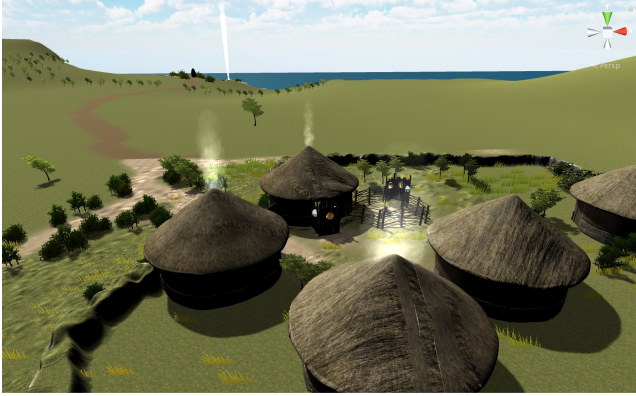
Figure 5: 3D environment of Iron age settlement close to Salt-dean's cliffs

for this project was optimised. To create the different visual assets, we used a variety of sources and resources: