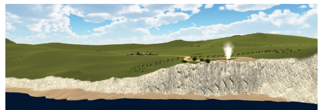
Figure 4: Terrain 3D model of the landscape with the settlement and burial site displayed

Trees, grass and fields were added in coherence with the historical aspect. However, we acknowledge that the VR landscape might not be exactly the same as the landscape in Iron Age. Nevertheless, the area with the sea cliffs, hills and deforestation is the closest that we could have to the Iron Age landscape. Hence, it has been used to provide the best possible representation with some compromise.