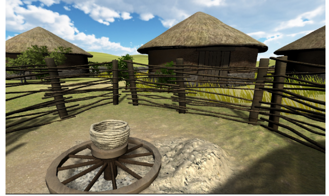
Figure 6: Manufacturing context with potter's wheel outside of a round hut

The interaction here happens when the user pours the content of the urn (some kind of grains or seeds, such as oats, rye, millet, spelt wheat, emmer wheat, barley and einkhorn wheat that were cultivated in the Iron Age) into the cauldron on the fire in order to make food. The user can also interact with a rotary quern