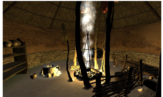
Figure 7: Storage context in the domestic environment of a round hut

stone by pouring seeds on it. The stone starts its rotating grinding movement and produces flour.