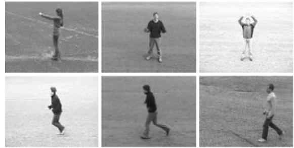
Fig. 6. Actions of the KTH dataset

scenarios of illumination, appearance and scale change. The dataset contains 2391 video sequences with resolution of 160 120 pixels. Actions of KTH data set are shown in Fig.6.