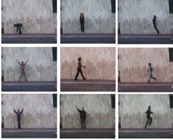
Fig. 2. Actions of Weizmann dataset.

Fig.4 presents the confsion matrix using spatio-temporal Krawtchouk moments with Laplacian Eigenmaps. The designations used in the Fig.3 and Fig.4 are: a1=" walk ", a2=" run ", a3="skip", a4="jack", a5="jump", a6="jump in place", a7="wave with one hand", a8= "wave with two hands", and a9="bend".these results show that spatio-temporal Krawtchouk moments is effectively for actions characterization,we have a good experimental results with a mean accuracy of 90%. In addition, the use of laplacian eigenmaps to reduce dimensionality of the representative vectors improves the classification rate and the mean accuracy becomes 91.55% . Some confusion are observed in the classification results and this can be caused by similarities found between some actions of the dataset. Fig.5 shows experimental results on weizmann dataset for several methods of action classification. The comparison shows that our approach achieves accuracy at 91, 55%. So, it is considered among the best methods. This results show the good efficiency of Krawtchouk moment to characterize global space-time shapes.