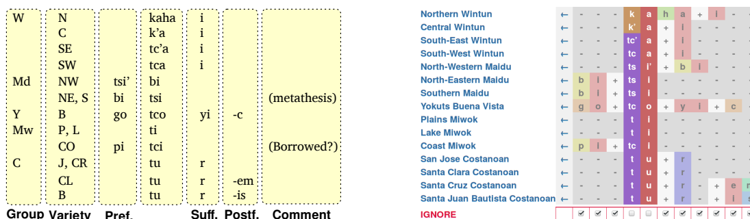
Figure 1: Early alignment example for translational equivalents of “nail” in aboriginal languages of California (based on Dixon and Kroeber 1919), contrasted with a “modern” representation using the EDICTOR tool (List 2017).

The words and morphemes which constitute a language are best modeled as sequences of sounds . Sequences have information content not only from their elements ( segments , whether these are phonemes, graphemes, or morphemes) but also via the order of the elements, a consistent comparison of sequences should account for both order and content. Alignments are a very general way to model differences between sequences. The major idea is to arrange two or more sequences in a matrix in such a way that similar or identical segments which occur in similar positions are placed in the same column of the matrix. If segments are missing in one sequence where no counterpart for a segment can be found, this is represented by a gap character , usually the dash -symbol (List, 2014b).