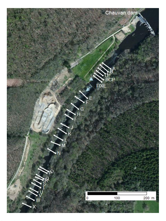
Fig. 1: Location of each cross-section (map from OpenStreetMap). The triangle shows the hydrometric station located upstream of a weir.