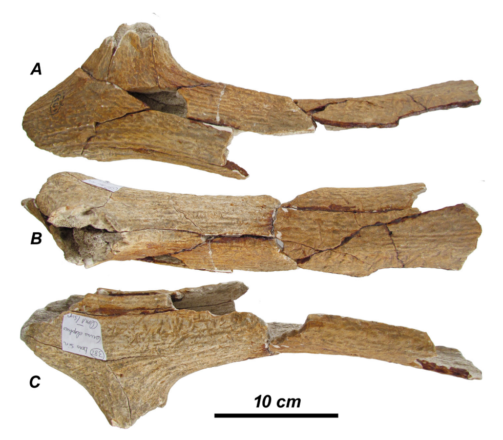
Figure 4 . The fragment of the left antler of Cervus canadensis from Climăuți II CLM-II-382 with basal portion of the broken middle tine: A, lateral side; B, upper side; C, middle side with cut marks.

Zdansky, 1925 (255 mm) from the Pleistocene of China (Zdansky, 1925: Pl. XV, fig. 1). However, the antler of Chinese wapiti has a longer crown part.