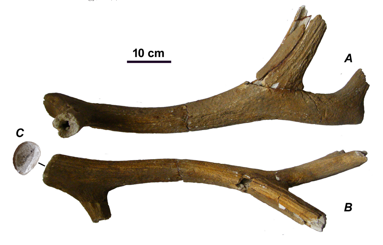
Figure 2. The distal fragment of the left antler of Cervus canadensis from Climăuți II CLM-II-381: A, lateral view; B, upper view; C, view from the broken proximal side.

ulna Nr. 5.22, which was regarded by Friant (1957: Pl. IV, fig. 8) as evidence for the complete fusion of radius and ulna in the Kent's Cavern giant stag, actually belongs to a horse (Lister, 1987). Lister (1987), however, confirmed that the osteological remains of the cave stag from Kent's Cavern are much larger than those of any living European red deer and equal in size to modern American and Siberian wapiti. Lister (1987) also indicated stockier limb bones of the wapiti-like deer from Kent's Cavern ("too short for their breadth": ibidem ), which approach the proportions of westernmost living wapiti C. canadensis songaricus ( C. elaphus songaricus according to Lister, 1987).