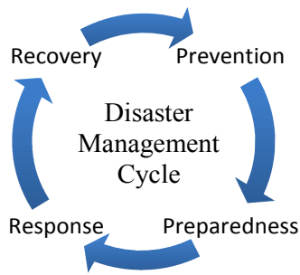
Fig. 2. Phases of disaster management cycle

Disaster management is defined as ‘the integration of all activities required to build, sustain and improve the capabilities to prepare for, respond to, recover from, or mitigate against a disaster’[12]. These four activities focus on risk management (prevention, preparedness) and crisis management (response and recovery) comprise the disaster management cycle as mentioned in Figure 2 [13]. These activities are not independent and sequential; indeed response and recovery phases initiate instantaneously, whereas populations have different long-term or short-term recovery operations can go on for days to months. Moreover, public health and economic recovery processes can take years or beyond that. The ultimate success of response and recovery activities are influenced by the data collected during the preparedness and prevention phases.