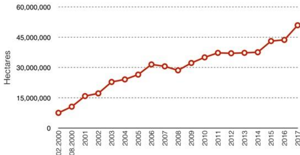
Figure 1. Certified organic agriculture hectares have grown at nearly 12% per annum for the past two decades but currently account for only 1.1% of world agriculture (Source: (Paull, 2017a).