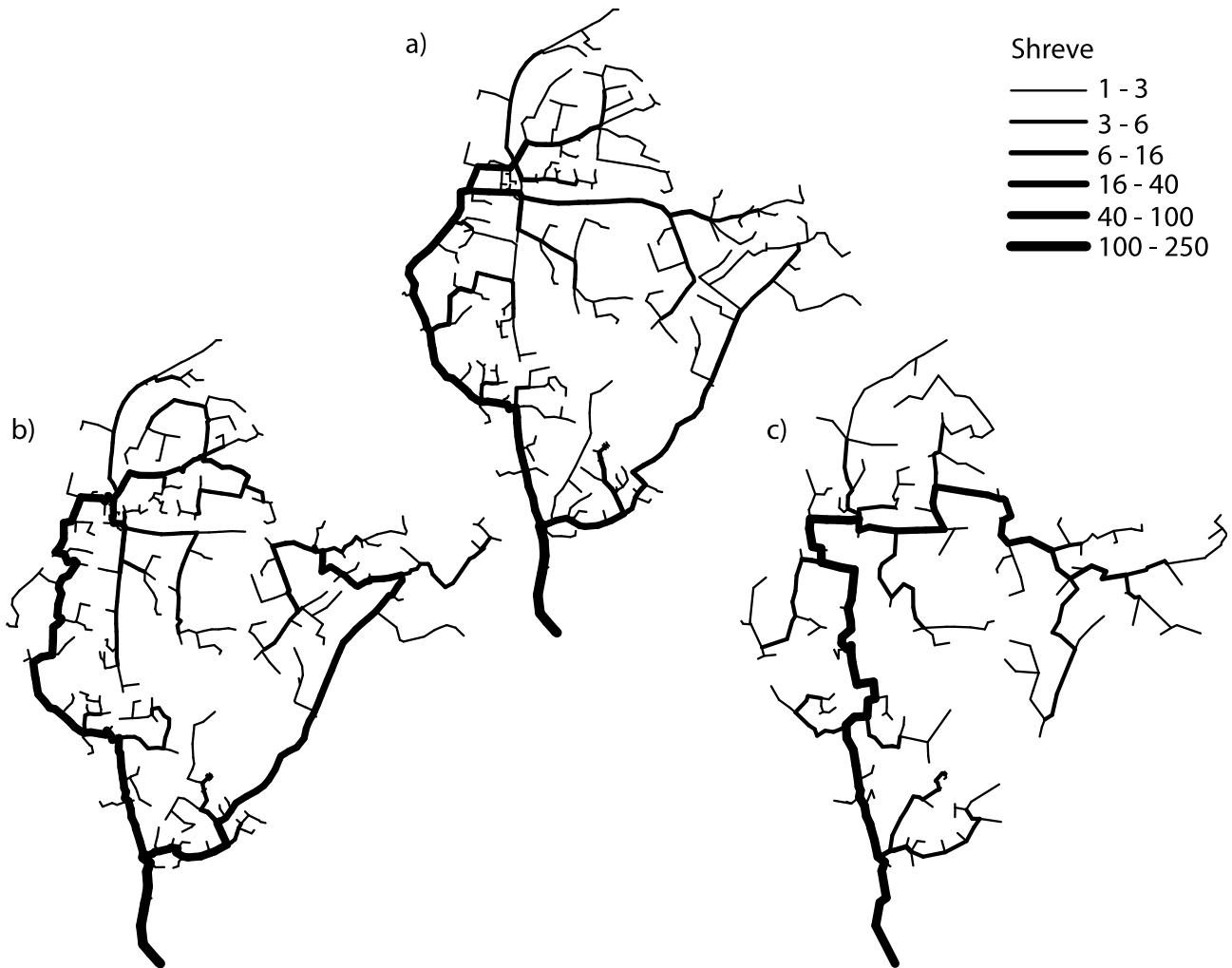
Fig. 1 Comparison between the actual and reconstructed networks using cost function 1 and \alpha=0.9 , \beta=2 and \gamma=5 . a) The actual network; b) The reconstructed network using the entire dataset; c) The reconstructed network using half of the manhole cover locations.

The actual and reconstructed networks (with all and half of the nodes) using the first cost function are presented in Fig.1. The best results are obtained for \alpha \geq 0.7 . This means that distance weights more heavily than elevation when formulated as in Eq.1. When the entire data set is used, the reconstructed and actual networks have similar Shreve stream magnitudes (131 and 125 resp. at the outlet). Based on Heipke et al., (1997), Correctness = 0.89; Completeness = 0.84 and Quality = 0.76 (Tab. 1). These values drop to 0.44, 0.55 and 0.32 respectively when using only half of the nodes and the Shreve stream magnitude at the outlet drops to 84.