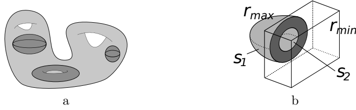
Figure 2: (a) 3D object with one connected component, three tunnels and three cavities. (b) Union of two regions r_{min} and r_{max} with in dark gray internal marked faces on r_{max} and in light gray, the two other surfaces s_1 and s_2 . In this case the merging of the two regions leads to the creation of a cavity associated to s_2 . s_1 is incident to the external surface of the union and thus does not lead to the creation of a new cavity.

The number of cavities b_2(r) of a region r is given by the number of included connected component of regions. The inclusion tree of regions is used to retrieve such information. An interesting property is that the number of surfaces of a region is equal to the number of cavities plus one. Indeed, for each cavity there is one internal surface and we have to count the external surface that is unique as there is only one connected component (in general the formula for the number of surfaces is b_2(r) + b_0(r) ).