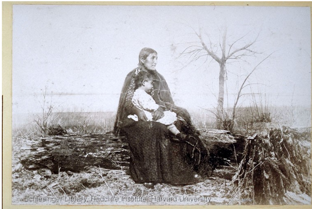
Harvard University, Schlesinger Library on the History of Women in America, 20036065_1