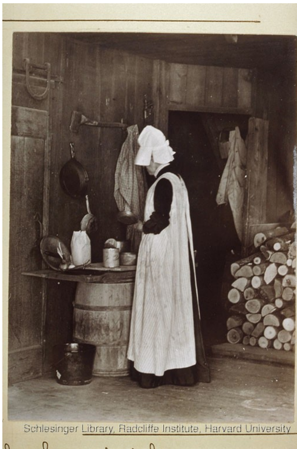
Schlesinger Library, Radcliffe Institute, Harvard University

Harvard University, Schlesinger Library on the History of Women in America, 20036070_1