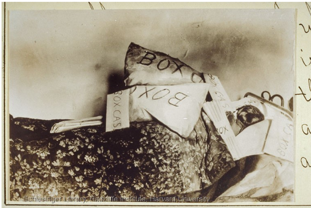
Harvard University, Schlesinger Library on the History of Women in America, 20036111_1