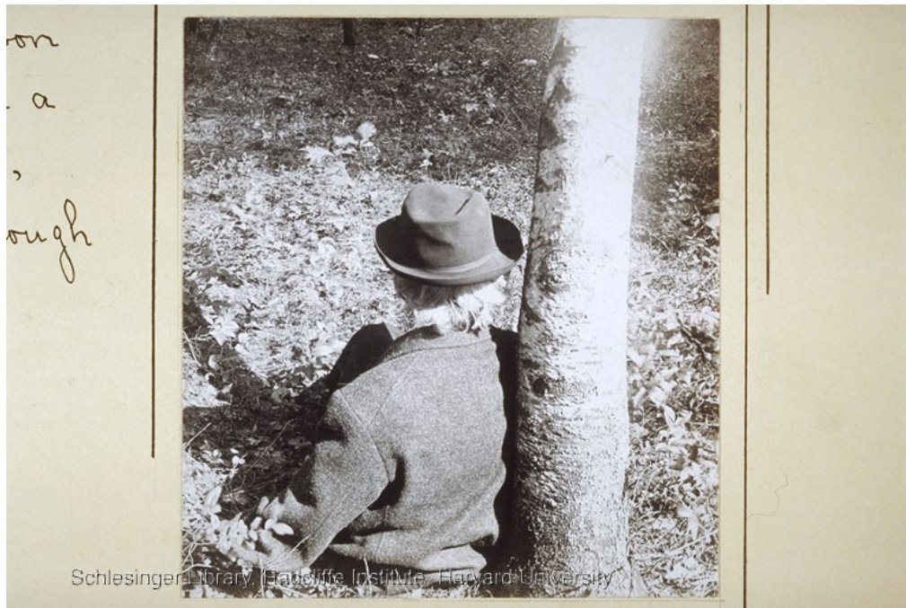
Harvard University, Schlesinger Library on the History of Women in America, 20036094_1