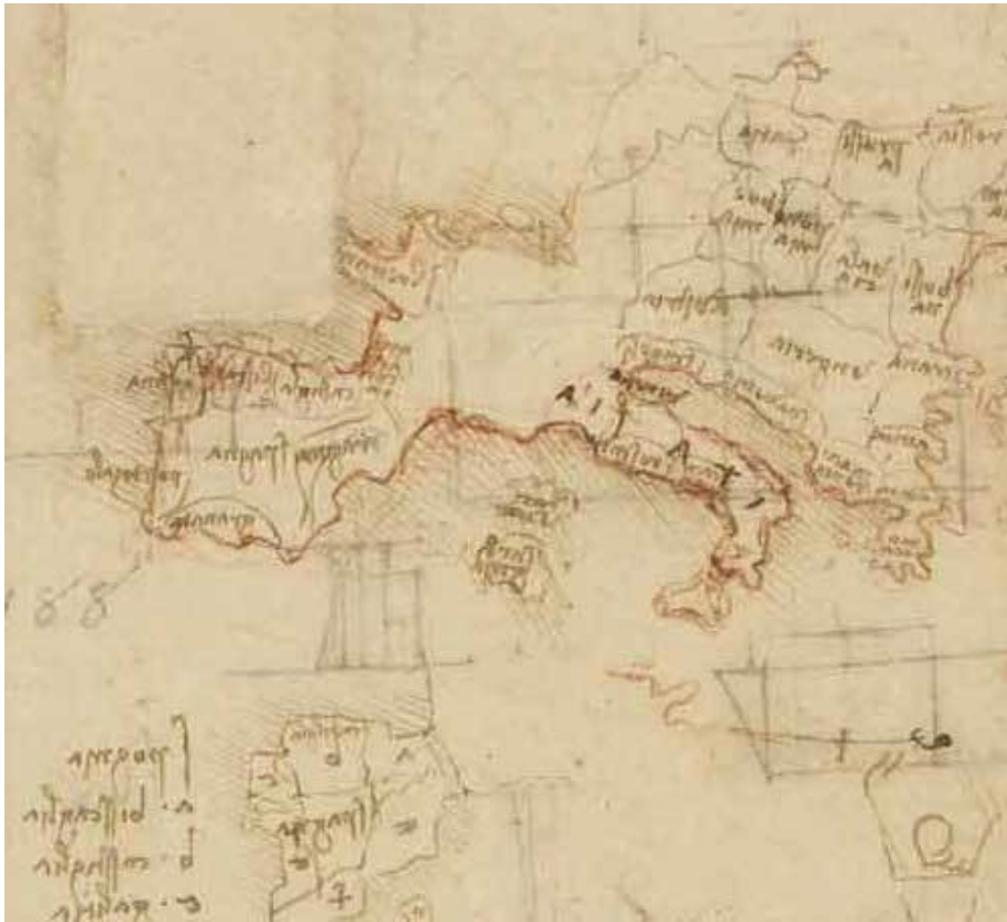
FIGURE 2. A map drawing by Leonardo da Vinci.

At the Renaissance, the need for drawing geographical maps was strongly motivated by the discovery of new lands. Leonardo da Vinci and Albrecht Dürer, who, besides being artists, were remarkable mathematicians, were highly interested in geography. They worked on the technical problems raised by the drawing of geographical maps, cf. [137], [121] and [139], and they also valued the beauty of these drawings. See Figure 2.