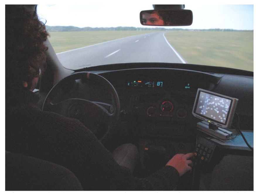
Figure 1 Simulator setup, showing the distractive task on the right