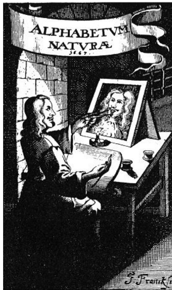
Figure 2, Frontispiece to Van Helmonts Alphabeti vere Naturalis Hebraici (1667)