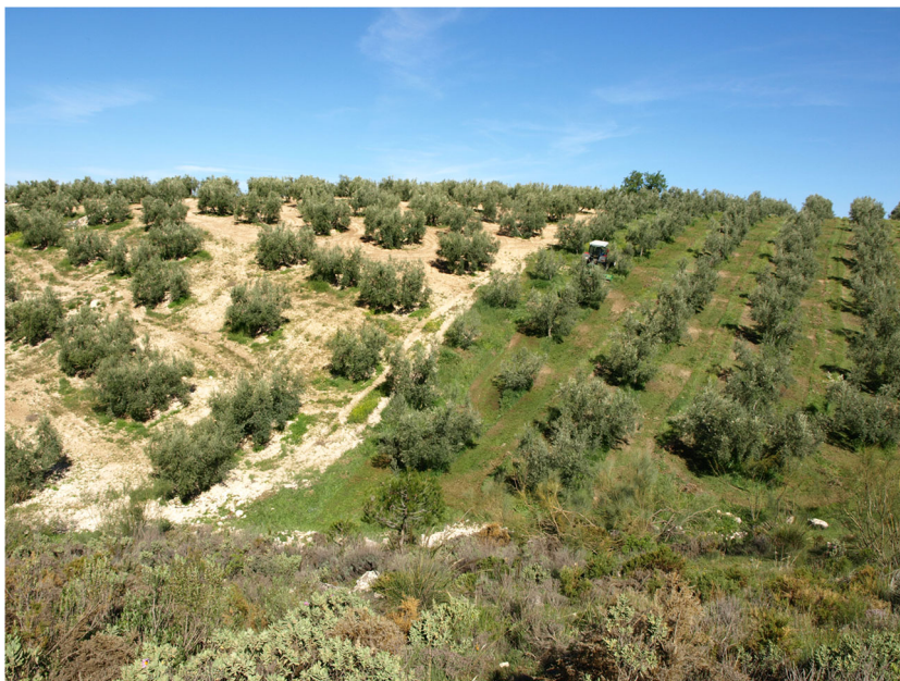
Fig. 1 Conventional ( left ) and organic ( right ) olive orchards in South Spain