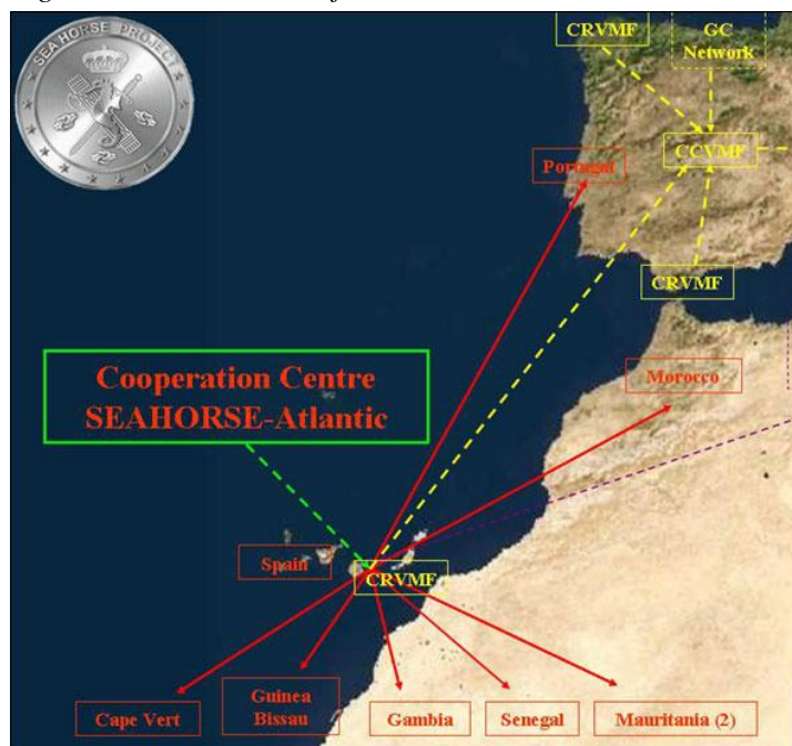
Figure 1. Visualisation of the 'SEAHORSE' network