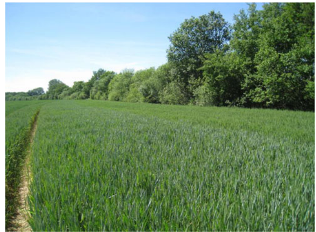
Fig. 2 Landscape elements surrounding a cereal field, southeastern France. Woody landscape elements for example can have different functions such as protection against wind and water erosion, habitats for beneficial insects and pollinators, production of timber and firewood, ecological corridors in agricultural landscapes, and biodiversity conservation