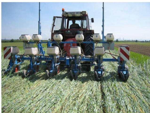
Fig. 6 Direct sowing of soybean into rye in southeastern France. This practice allows permanent soil cover and thus control weeds, decrease nutrient leaching, wind, and water erosion. Also soil organic matter is increased and higher soil biota activity achieved which leads to improved soil fertility

Reduced or no tillage practices help reduce energy inputs and thus increase cropping system efficiency. Other advantages are protecting the soil from erosion (organic matter at the soil surface), stocking organic C (less C mineralisation), and