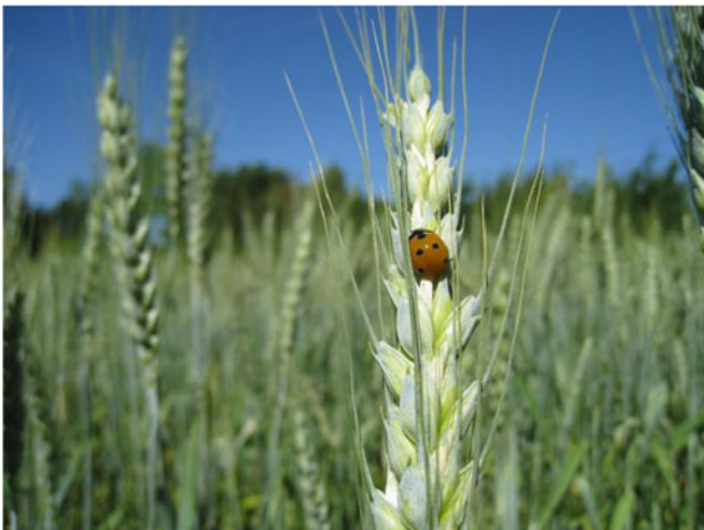
Fig. 1 Conservation biological control: preservation or creation of habitats near fields or in the larger landscape for reproduction, over-wintering, or shelter during different phases of life cycle of beneficial insects which then can control pests. The present photo shows a ladybird beetles, a natural predator of aphids, on organic wheat in southeastern France

Practices such as organic crop fertilisation, crop rotations, or biological pest control are well-known agricultural