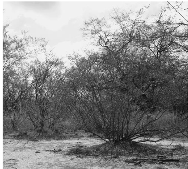
Fig. 1 Larrea divaricata , showing a typical multistemmed architecture in the semiarid Chaco vegetation of central Argentina

Biomass models have been developed for a number of shrub species in different ecosystems of the world (Ludwig