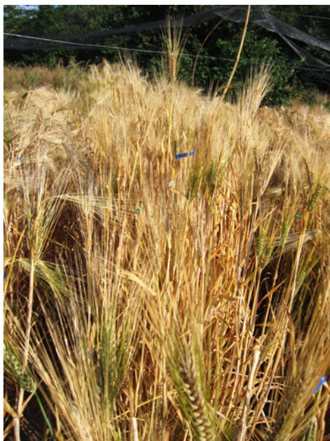
Fig. 3 Barley landrace from Santorini Island, Greece

reaching 9,084 accessions. However, FAO (2010) reported that a decrease in global barley holdings was observed from 1998 to 2010 (485,000 to 466,531, respectively).