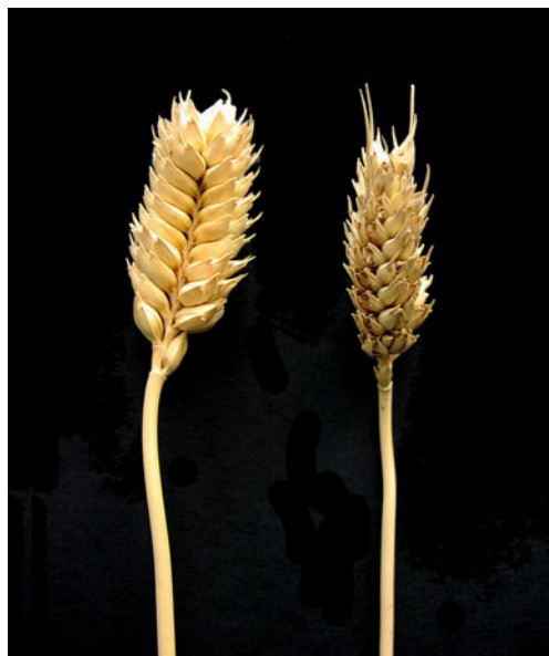
Fig. 2 Wheat landrace “Rapadinho” from the Archipelago of Madeira, Portugal

For the purposes of this overview, information provided by WIEWS (2012) was used to perform a more detailed analysis of the status of wheat landraces in the global system of GeneBanks. A total of 859,472 accessions of wheat germplasm were found to be maintained in GeneBanks in 90 countries within Europe, America, Asia, Africa and Oceania. However, only 225,120 accessions (26 % of the total) were classified as wheat landraces or related accessions (accessions selected from landraces), while the remaining wheat accessions were identified as improved cultivars, breeders' lines or were of unknown status. GeneBanks from 61 countries reported holding wheat landraces in their germplasm collections. Among them, 209,469 accessions were classified as true Triticum sp. landraces, representing 93 % of the total number of wheat landrace accessions. The remaining 15,651 accessions were simultaneously and indiscriminately classified as landraces, wild