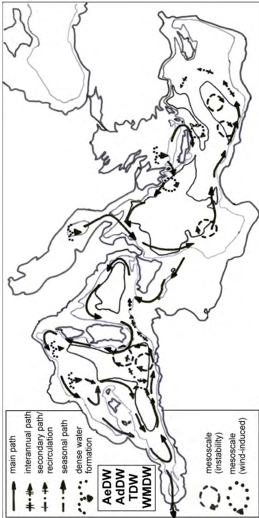
Fig. 4. Circulation of AeDW, AdDW, TDW and WMDW extrapolated from [9] for the Western Basin. The thin lines represent the 1000-m and 2750-m isobaths