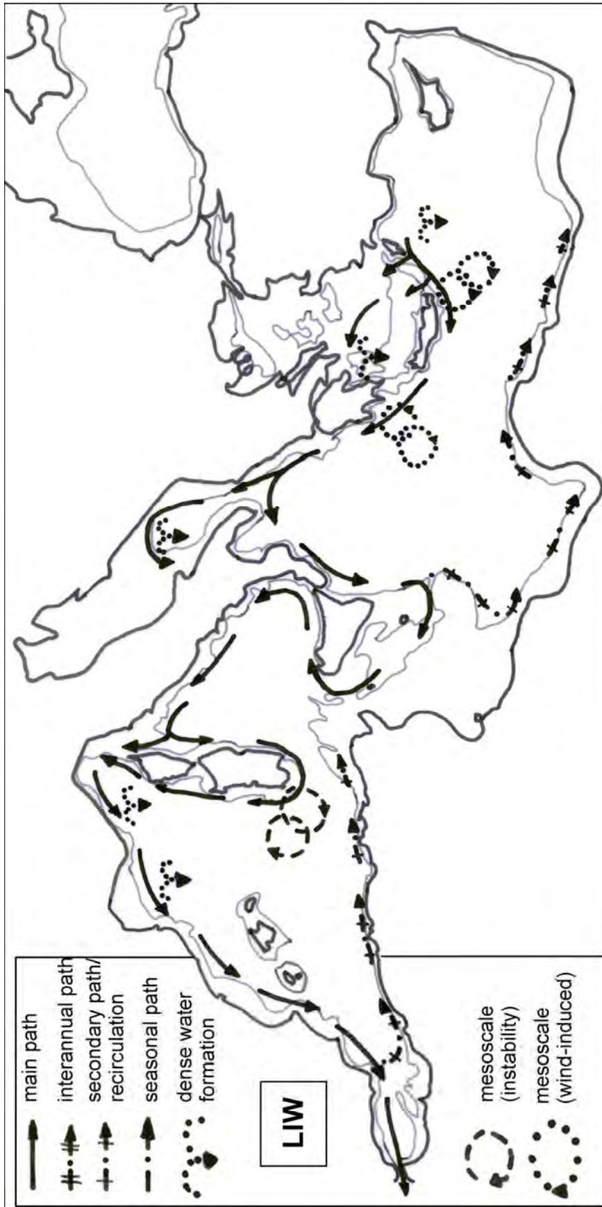
Fig. 3. Circulation of LIW extrapolated from [9] for the western basin. The thin line represents the 500-m isobath.