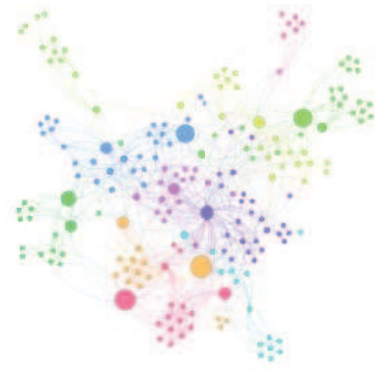
Fig. 4. Network of concepts generated for December 12, 2013 containing the hashtag: #noalospluris.