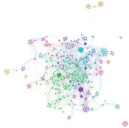
Fig. 3. Network of concepts generated for December 11, 2013 containing the hashtag: #noalospluris.