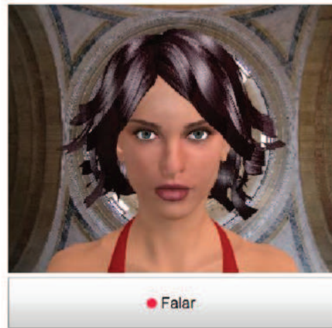
Figure 2: The User Module: a simple Web page with a talking head.

The DC object plays the managing and controlling role of the system. It is responsible for replying to the user by giving a suitable answer or by asking a question to go on in