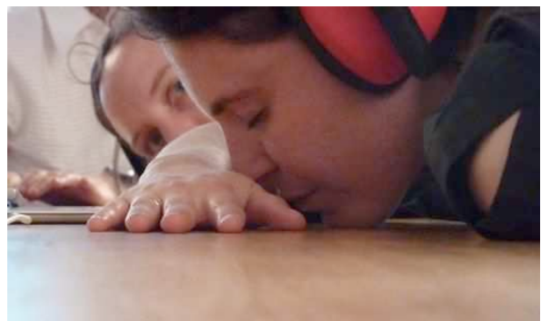
Figure 1. Sound Table © Art&Fact

Conceived with the aim of acute listening, giving attention to material specificities and caring sensorial diversity of users, the sonotactile devices 5 offer an opportunity to build new relationships with the world of sound by the controlled vibration of objects or movable sets. Acoustic studies and critical experiments we conducted were used to develop rigorous specifications that led to the design of our hardware tools, furniture and software.