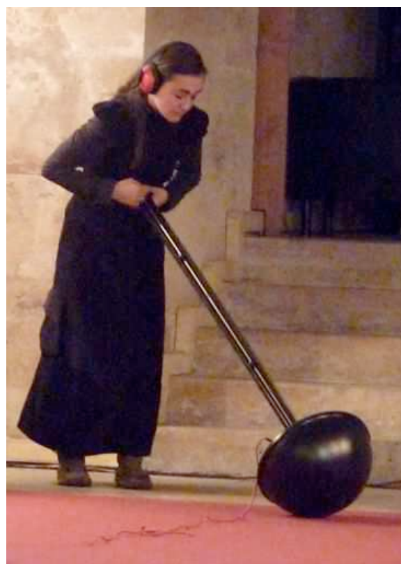
Figure 5. Posture on Listening Station

to our own voice [6]. This feeling is very present here and modifies the usual representation of our body in space, moving borders from outside and from within [7].