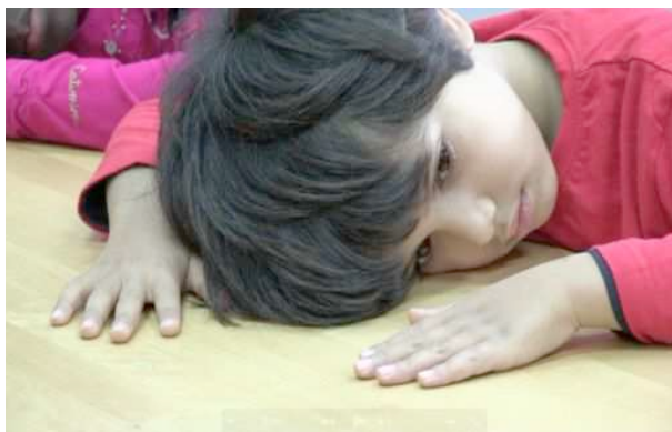
Figure 4. Posture on Sounding Table . Pedagogic workshop at the National Institute of Deaf Youth.

Listening on the wooden table calls for relaxation. The body surrenders, with the chest resting, and head and arms in contact with the wood. Exploring listening through touch leans towards musing: objects speak to us, transmit signals from elsewhere. Reception on Sound Tables is mixed: both diffusion - as a speaker -, and solid reception (see Figure 4). The table allows several persons to gather, invites to share her/his feelings and promotes interactivity between participants.