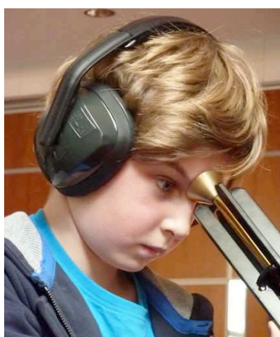
Figure 2. Listening Station

Likewise, the solid Listening Stations are devices that enable one to perceive sound through bone conduction. A vibrating metal rod, in contact with one's chin or other parts of the head, enable one to become aware of extremely precise sound information, without air conduction.