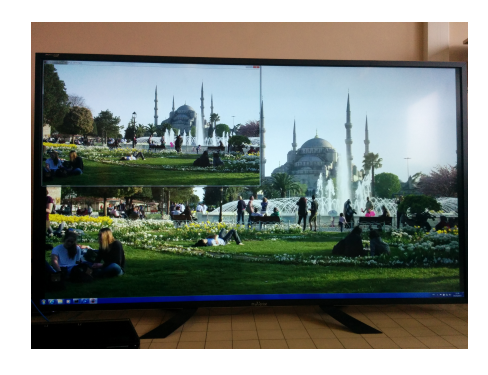
Fig. 2 . GPAC player displaying 4K and HD video sequences on a 84 inches 4K TV

The default configuration displays the highest decoded layer. However, the client can switch between the base and the enhancement layers by ctr+l and ctr+h, respectively. Figure 2 illustrates the proposed demonstration displaying both HD (on the left) and 4K video sequence on a 84 inches 4K TV