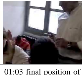
01:03 final position of G's hand after moving upwards.