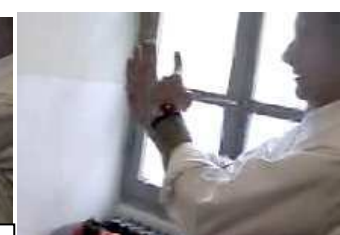
00:28 T: right hand vertically raised